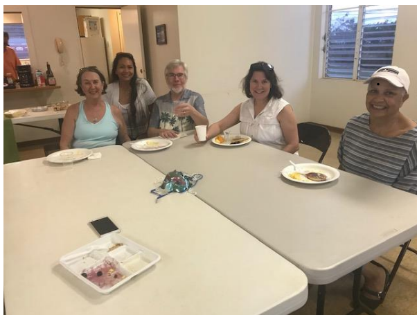
Shrove Tuesday Pancake Supper 2/25/20